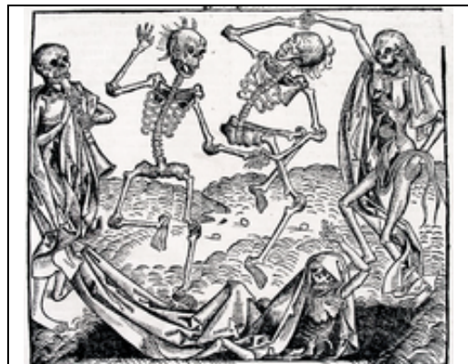
Even art has changed, with images of death replacing images of heaven!

From the looks of it, all of us will be dining with our ancestors very soon. [That supper table is very crowded.]